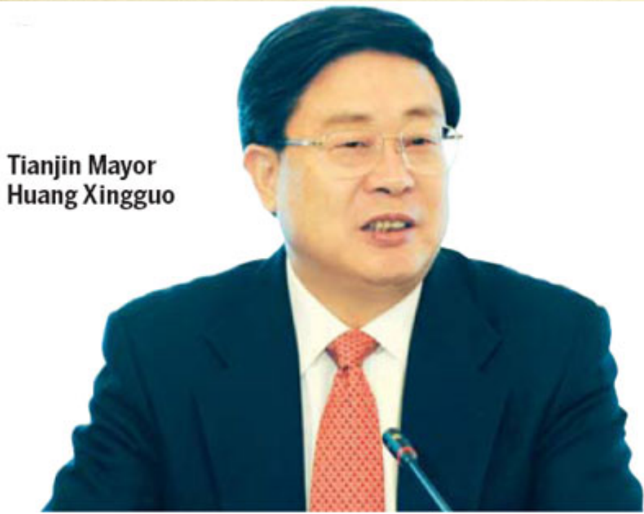
Tianjin Mayor Huang Xingguo